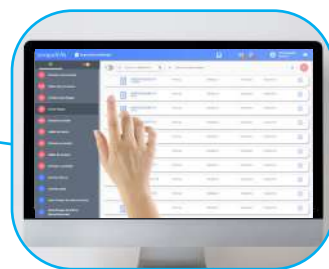
Design and usability in touch-screen environments.