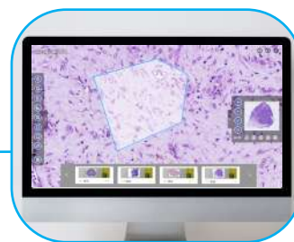
Thumbnail image gallery connected to internal and external viewer.