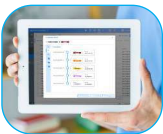
Global element locator, information management and traceability.