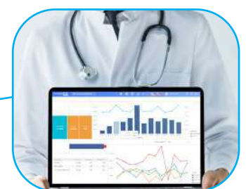
Statistical and scientific exploitation, by means of dashboards.